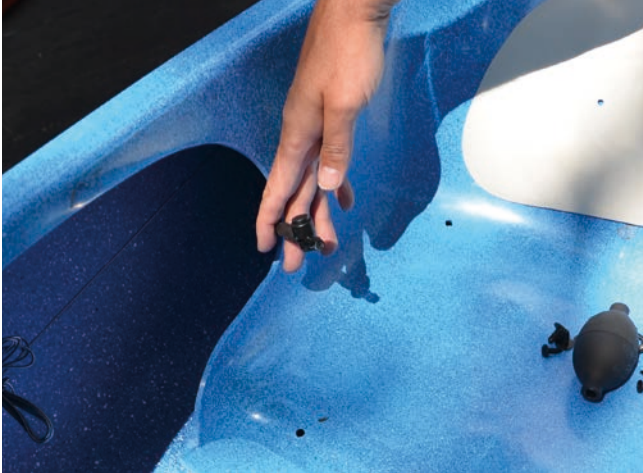
7. Pull the hose along the side of the seat until it comes out into the cockpit.