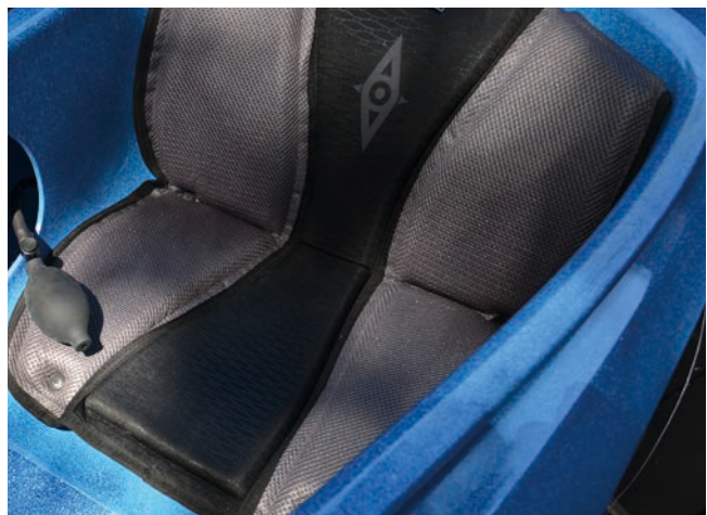
12. Continue in the same way at the front of the seat pad until seat pad has been fastened securely. The seat is now installed, adjust the back rest to your most comfortable paddling position and get out on the water!