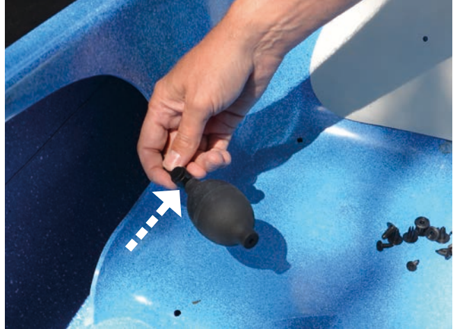
8. Attach the air pump onto the valve on the rubber hose.