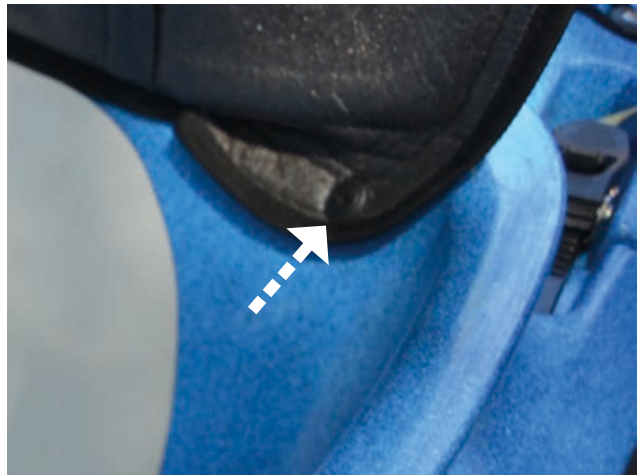
10. Attach the seat pad starting at the top of the seat. Start by placing the seat pad upside down with the inside towards you and push in the wide female part of the plastic push screw through the hole of the seat pad into the hole. Push the thinner male part into the hole to secure the screw.