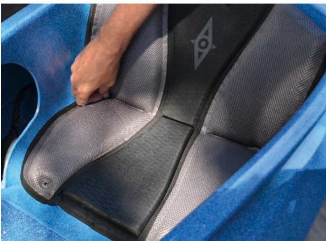
11. Flip down the seat pad and use the grease pen to mark where the hole for next push screws should be. Drill the two holes and secure the seat pad.