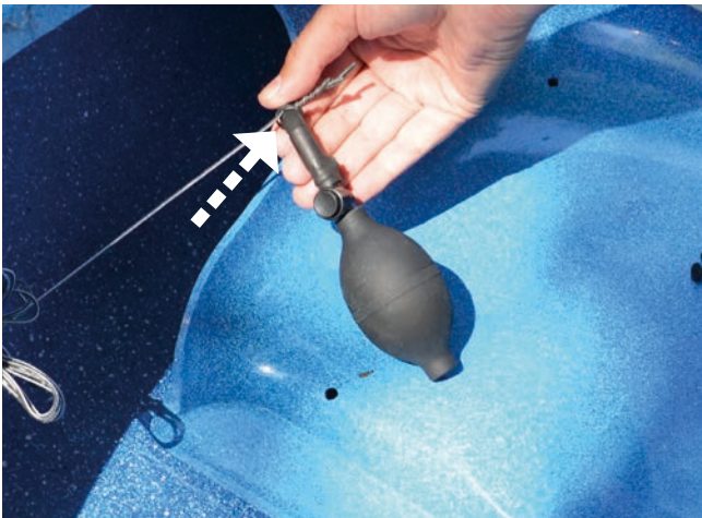
9. Secure the rubber hose to the rudder line with a cable tie or twister. Not too tight. Test the pump to make sure the air pad is inflated easily. Deflate the air by pushing the valve button and pushing the air bag with you hand.