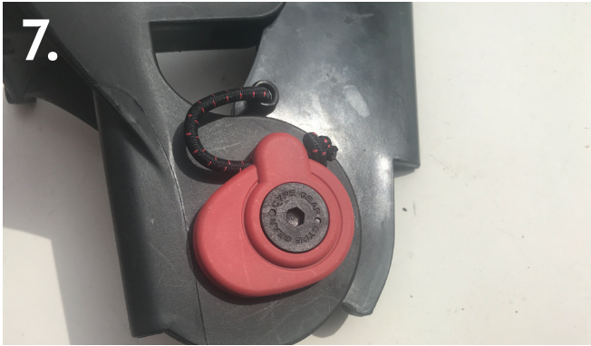
7. Make a knot on the end of the cord and pull back