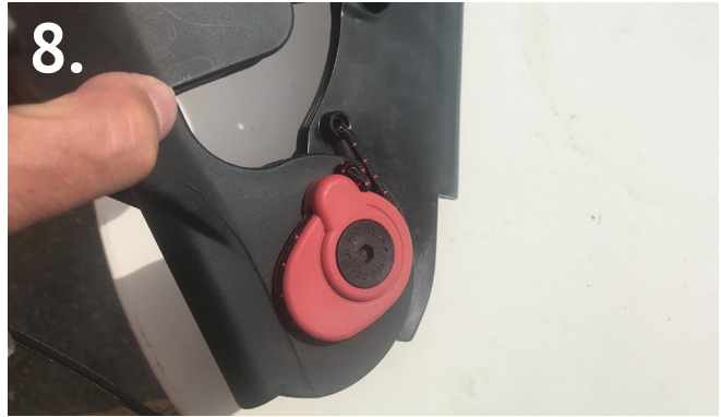
8. Pull the cord around the red oval "ear" on both sides